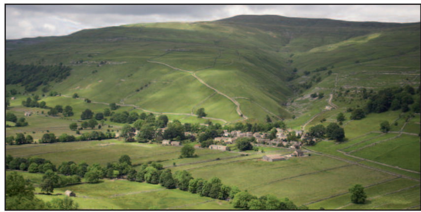
Starbotton and Cam Gill.